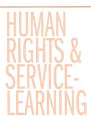
TABLE OF ONTENTS